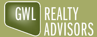
Bradley Business Park

Sifton Properties Limited, London's premier builder is proud to manage the property on behalf of GWLRA. Tenants of Bradley Business Park receive the same exceptional quality and outstanding customer service as all Sifton tenants.